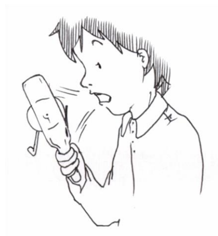
Fig. 2 Humidifying the Unit when the air is dry